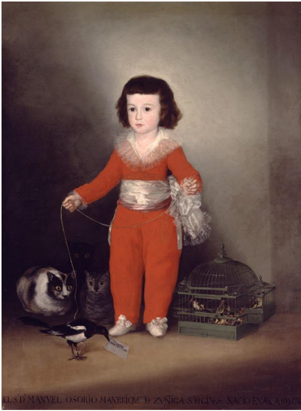
Francisco Goya, 1746-1828, MANUEL OSORIO DE ZUNIGA