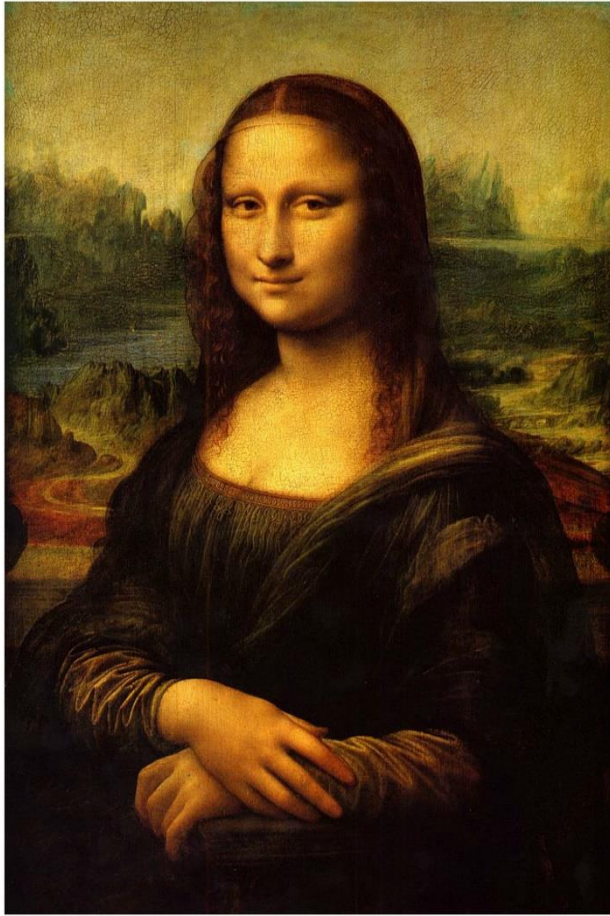
"The Mona Lisa" 1503-1517, Leonardo da Vinci