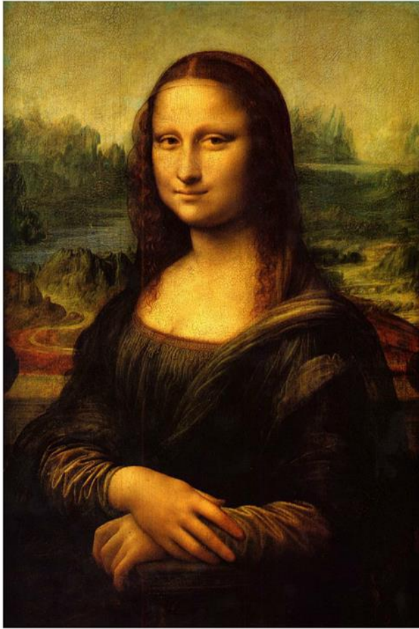
"The Mona Lisa" 1503-1517, Leonardo da Vinci